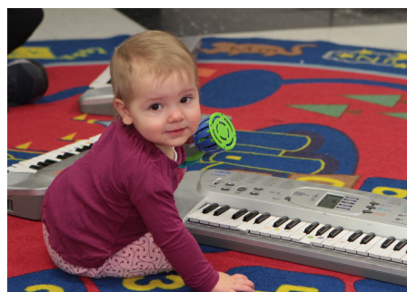
Happy Piano Baby Bounce class available this fall

Participants can register on-line in the comfort of their own home at rockvillecentre.recdesk.com or at the Recreation Center office during regular office hours.