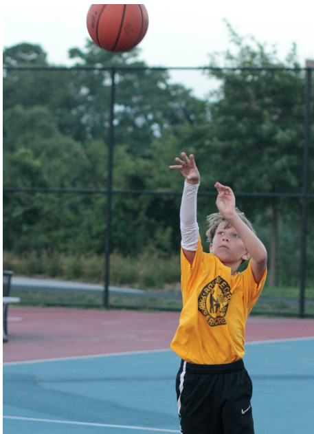
Basketball Playoffs begin in August

Register for all Recreation Department activities at rockvillecentre.recdesk.com